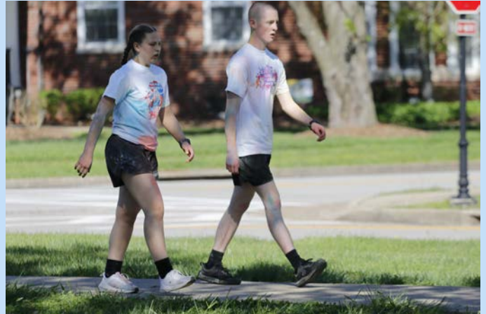
Our cadets participating in several activities!